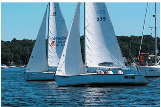
Racing at the New York Clinic