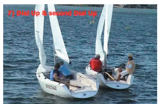
Snapshot from Curriculum Video